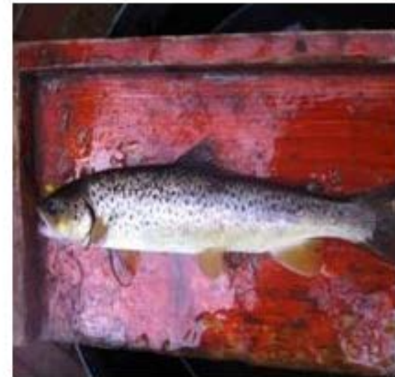
Medlock Trout (There were no fish before)