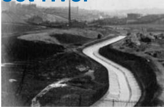
The Old Medlock