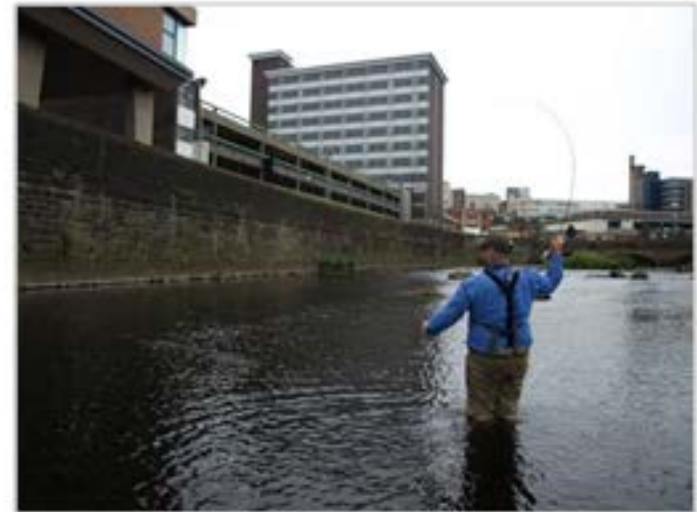
Urban fly fishing central Sheffield