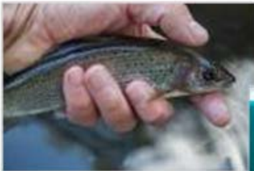
Grayling and trout central Sheffield