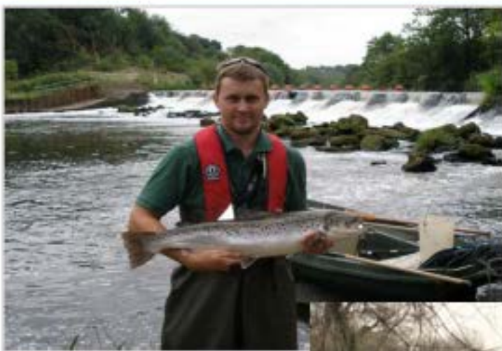
2006 Salmon caught by EA staff below Sprotbrough weir before the fish pass