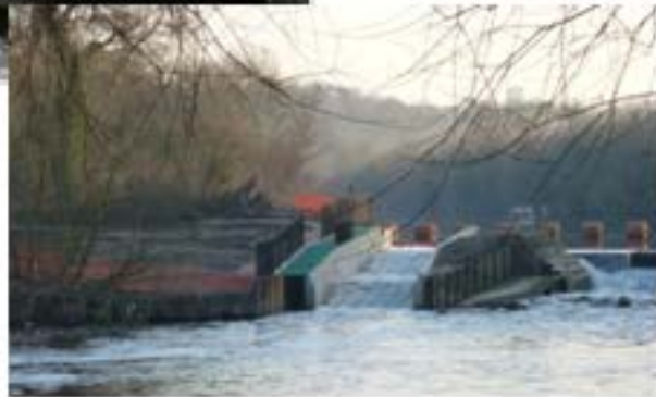
2014 Sprotbrough fish pass