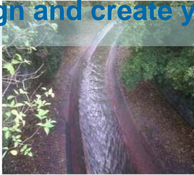
Before Works started