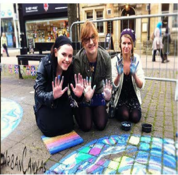
Urban River - Burnley, Lancashire UK 2013